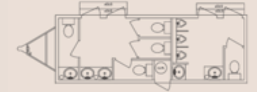
CAD drawing for 24-foot Prestige*