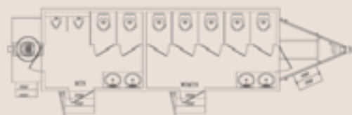
CAD drawing for 20-foot Advantage Series*