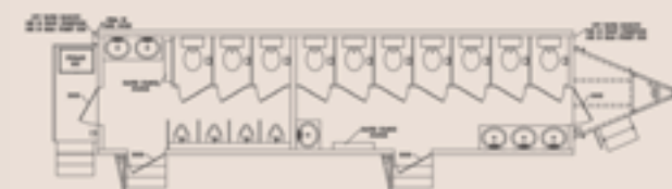
CAD drawing for 32-foot Advantage Series*

*CAD drawings for other trailer and skid sizes available upon request.